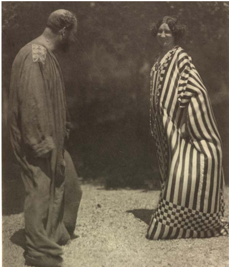
Fig. 8. Heinrich Böhrer, Gustav Klimt and Emilie Flöge, 1909. Austrian National Library/Vienna, inv. no. Pf 31931 E (2).