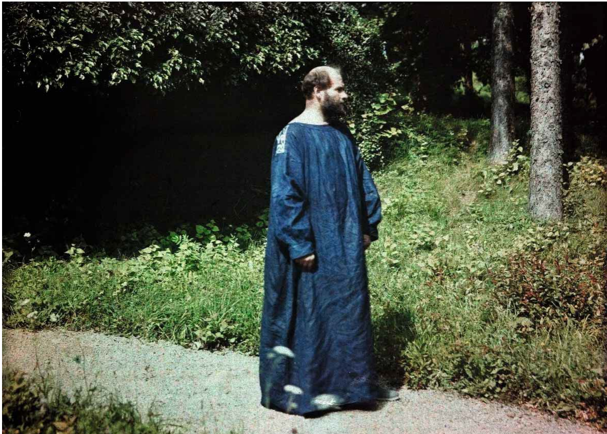
Fig. 9. Friedrich G. Walker, Gustav Klimt In the garden oft he Villa Paulick in Seewalchen on Lake Attersee, 13/14. September 1913. Autochrome Lumière Plate, Private collection.

„Sommerfrische“, of Klimt in his painter's smock seem to have had a documentary purpose (Fig. 9). One of these pictures is indeed a unique specimen: it is the only color photograph of Gustav Klimt that has been passed down to us 37 . The Lumière Autochrome process, patented by the Lumière brothers and first marketed in 1907, was greeted as a sensation by amateur photographers: for the first time it was possible to capture, in only one exposure, the world in "natural colors" (according to the Lumière brothers' advertising). Amateur photographers were now finally able to record family festivities and vacations in color, although this process was still relatively expensive. Only very few professional photographers, among them Heinrich Kühn and Edward Steichen, explored the artistic possibilities of this new color process.