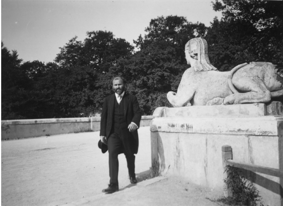
Fig. 14. Gustav Klimt at Schönbrunn Palace Park in Vienna on his way to the Meierei Tivoli, 1914

Private photographs of Gustav Klimt after 1916, the last year he spent summer holidays on Lake Attersee, are rare. The fate of oblivion also befalls those private snapshots of Gustav Klimt when the circumstances of their creation defy reconstruction and they become an imaginary recollection of events and history.