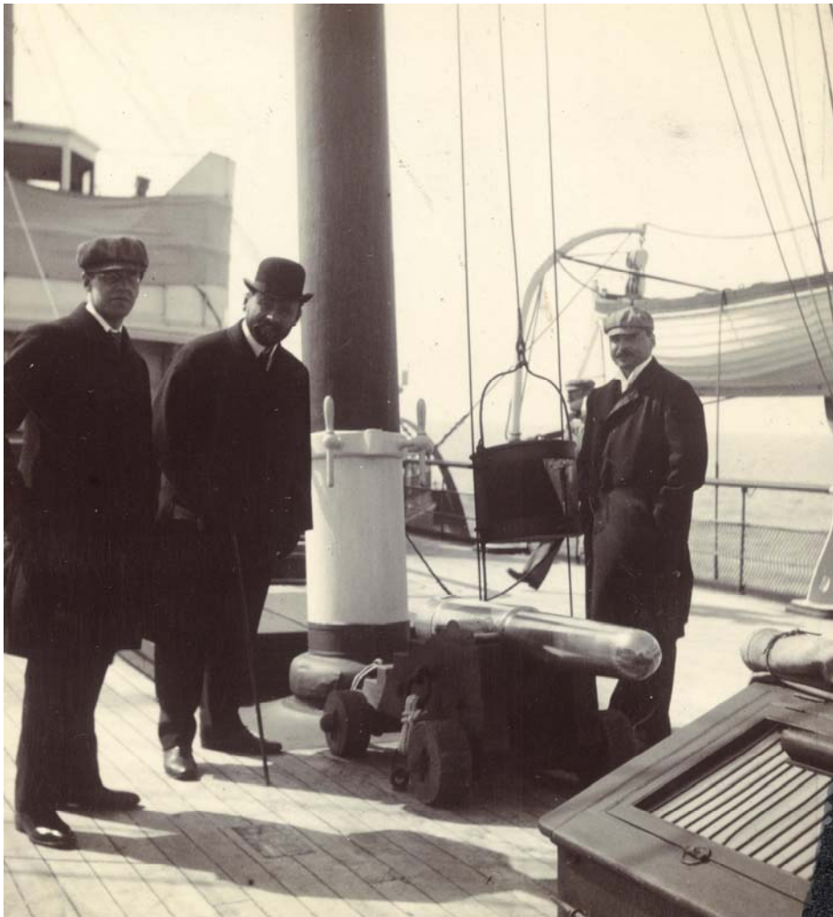
Fig. 13. Gustav Klimt during the crossing to London together with Karl Otto Czeschka and Fritz Waerndorfer, 1906, Austrian National Library/Vienna, inv. no. Pf 31931 B (2a).

his postcards to Emilie Flöge from these journeys are often litanies of annoyances and insecurities. There is photographic documentation of his trip to London in 1906: these pictures, shot in 2\frac{1}{4} \times 2\frac{1}{4} -inch ( 6 \times 6 cm) format with roll film, are primarily of the Channel crossing on the ship and are fascinating for their precise exposure technique (Fig. 13). The snapshots taken of Klimt in Vienna and vicinity provide a glimpse into the artist's day-to-day habits; that is, they recount short episodes of a life story that has remained only a fragment. Klimt's daily routine proceeded according to a strict schedule and has also been preserved through photographs. Early each morning (before 6 a.m.), Klimt would leave his apartment on Westbahnstrasse and walk to the Tivoli café, near Schönbrunn Palace, where he had breakfast with his circle of friends and "was, as an illustrious habitué, coddled and pampered" 43 (Fig. 14). For thirty years his friend Moritz Nähr accompanied him there. After a hearty breakfast, Klimt trekked through the grounds of the adjacent Schönbrunn Palace to his studio, until 1912 on Josefstädter Strasse and later on Feldmühlgasse, in Hietzing, where he shut himself in and worked until evening.