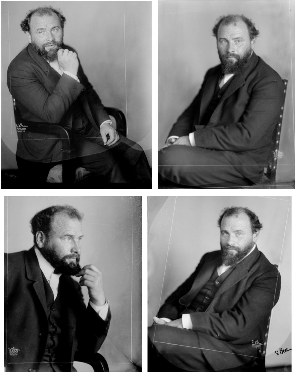
Fig. 2a–2d. Madame d’Ora-Benda, Gustav Klimt in a three-piece suit, 1908. Original glass plates with cutting marks of Atelier d’Ora-Benda, Austrian National Library/Vienna, inv. no. 203435-D, 203436-D, 203437-D, 203438-D.

presented them to friends as mementos. Gustav Klimt used one picture from this portrait series as his passport photo. The passport was issued on 24 May 1917 by the Imperial and Royal Police Authority in Vienna and permitted Klimt to undertake “recreational trips” during the war years within Austria 26 (Fig. 4).