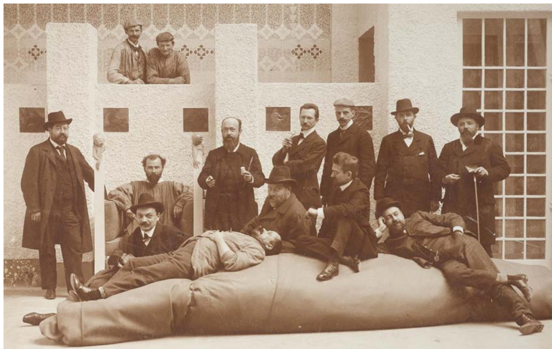
Fig. 5. Moritz Nähr, Gustav Klimt with a group of artists of the so-called Beethoven exhibition, April 1902. Silver gelatine print, Austrian National Library/Vienna, inv. no. Pf 31931 D (3a).

Let us return to the period around 1900, when the crisis Klimt experienced due to the public rejection of his university paintings by the press and his clients was in its initial phase. A comparison of portraits taken by Moritz Nähr serves to illustrate the transformation that Klimt’s self-promotion underwent.