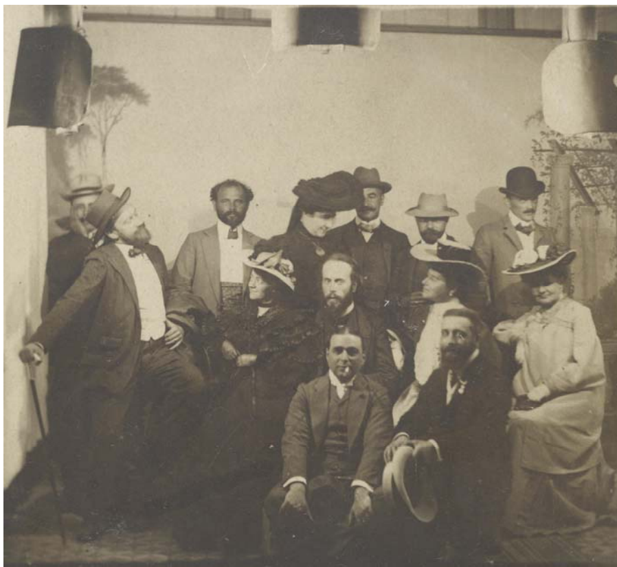
Fig. 6. Gustav Klimt with members of the “Club of Seven”, 1894. Silver gelatine print, Austrian National Library/Vienna, inv. no. Pf 31931 B (1).

Until the turning point in 1905, Klimt basked in – and made a public display of – the pioneer role he played in both artistic and social contexts. In 1902, at the Fourteenth Secession Exhibition, Moritz Nähr had photographed the group’s members in the Secession shortly before the exhibition opening (Fig. 5). The arrangement and the casual poses of the artists appear arbitrary, but they were in fact carefully staged: Klimt is not given center stage among his fellow artists; what sets him apart in a motific sense is his sitting position. This motif-like “detail” had appeared as early as 1884 in a very similarly arranged picture by an unknown photographer, taken at the opening of the “Siebenerclub” (Club of Seven) (Fig. 6), and was to be repeated frequently in comparable photographs. Nähr later produced a variation of this group photo of 1902, creating an individual portrait of Gustav Klimt in the same pose, a picture that has often erroneously been thought to be an enlarged detail of the original group portrait. This portrait photo is the first to show Klimt in his characteristic painting smock. Nähr’s “spin-off” shows Klimt “enthroned” in the exhibition space of the Secession with his painter’s smock, holding his paintbrushes – as characteristic props – and adopting a seated pose familiar to us from Renaissance portraits of royalty. Here, Klimt presents himself (in a public space) in the sovereign symbolism of an “artist-monarch” (Fig. 7).