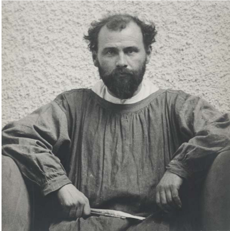
Fig. 7. Moritz Nähr, Gustav Klimt, April 1902. Silver gelatine print Austrian National Library/Vienna, inv. no. Pf 31931 D (3a).