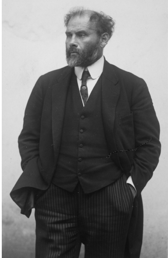
Fig. 3. Moritz Nähr, Gustav Klimt in front of his studio in Feldmühlgasse 11, 1917, Silver gelatine print Austrian National Library/Vienna, inv. no. Pf 31931 C (4).