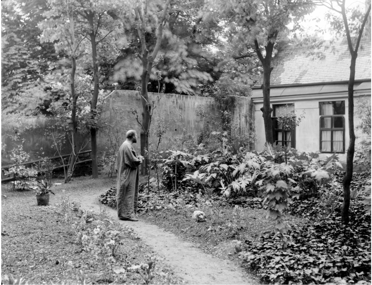
Fig. 11. Moritz Nähr, Gustav Klimt in the garden of his studio at Josefstädter Straße 21, May/Juni 1911.