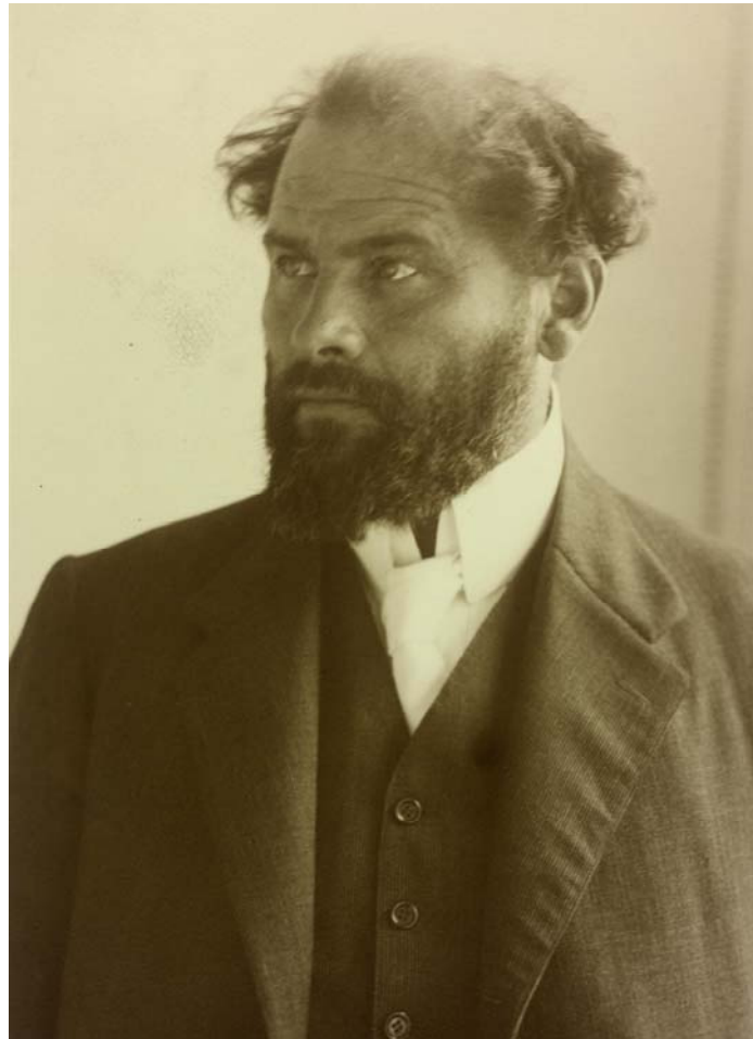
Fig. 1. Moritz Nähr, Gustav Klimt, c. 1910. Silver gelatine print, Austrian National Library/Vienna, inv. no. Pf 31931 C (2).

taken during the “Sommerfrische” on Lake Attersee, which are distinguished above all by their private character 5 .